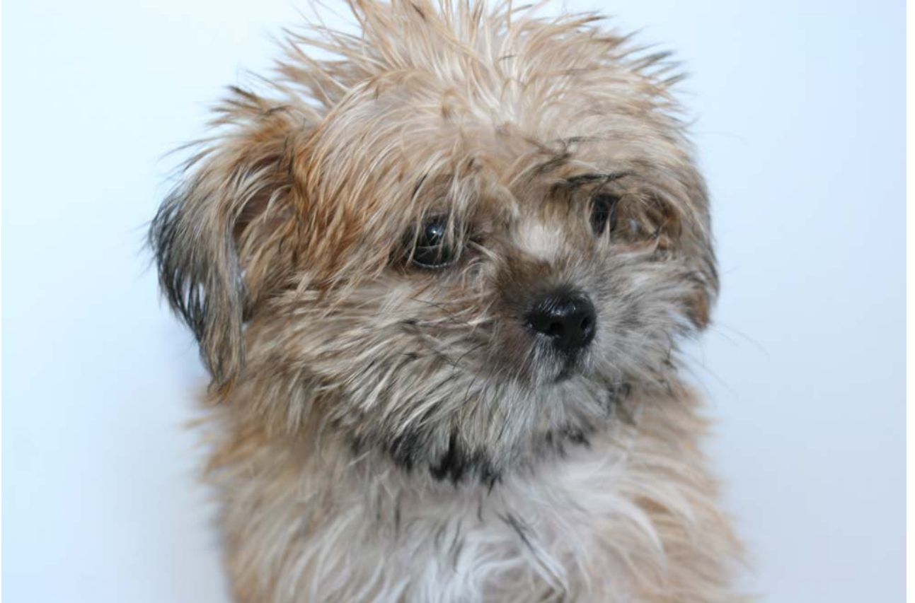
Rusty, TLC's official mascot - Chinese Shih Tzu.